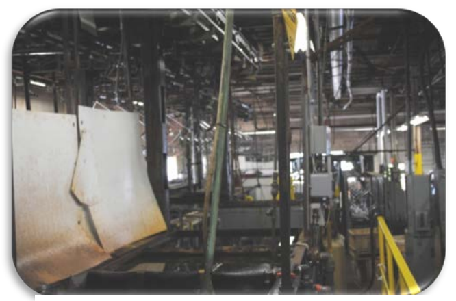
New tri-chrome line showing movable isolation wall

In addition, due to the configuration of the Independent line with hex- and tri-chrome baths running in parallel (see Figure 1.2), they were concerned about the possibility of hex-chrome carrying over into the trichrome bath. To reduce the potential for this